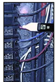
AC Voltage in junction boxes

...and many additional applications where voltage needs to be detected