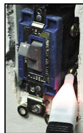
AC Voltage in switches