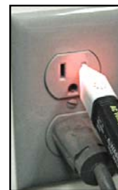
AC Voltage in wall receptacles