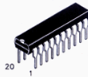
N Suffix Plastic DIP AVG-005 Case